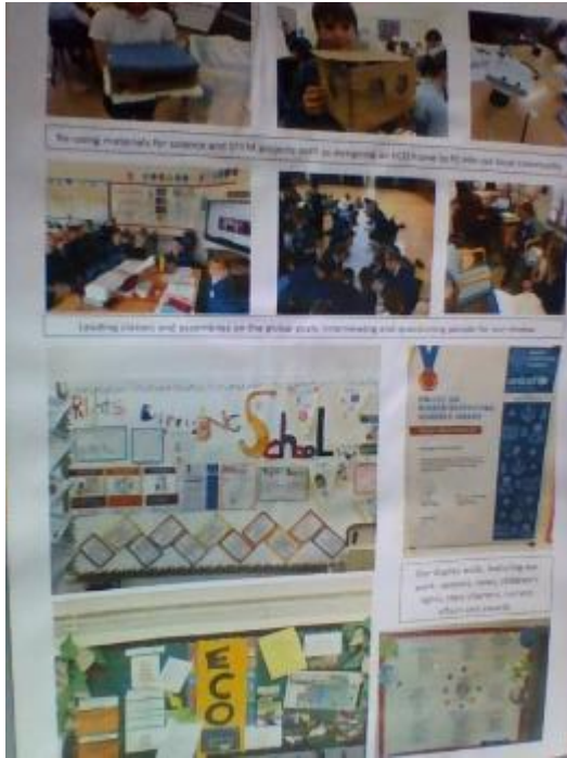
K.P.S. Website - Eco Page