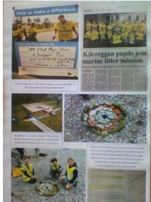
K.P.S. Website - Digital Leaders